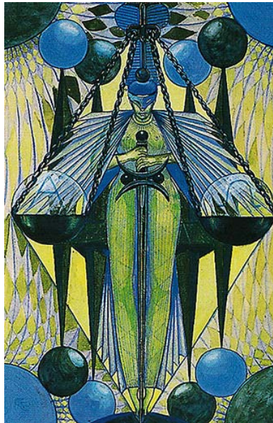
Adjustment from the Thoth Deck

For instance, if someone is struggling with chaos and overwhelm at that time, cards ruled by Libra such as Adjustment/Justice can suggest ways of finding equilibrium and balance.